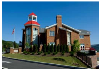
Durrwachter Alumni Conference Center

Our Admissions staff is dedicated to providing exceptional customer service to every family that walks through our doors. It is my hope that you will continue