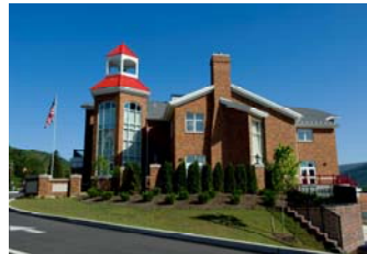
Durrwachter Alumni Conference Center

In addition to these changes, several departments have completely overhauled their programs to better serve students.