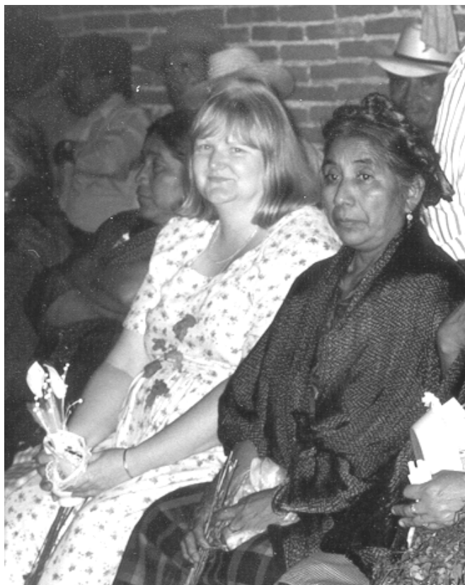
Picture was taken at a wedding in Mexico - holding ceremonial herbs and wearing ceremonial flowers.

INTERESTING FACTS: My current research is on the religious practices of the Zapotec Indians in Oaxaca, Mexico.