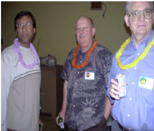
3 guys just hanging out!