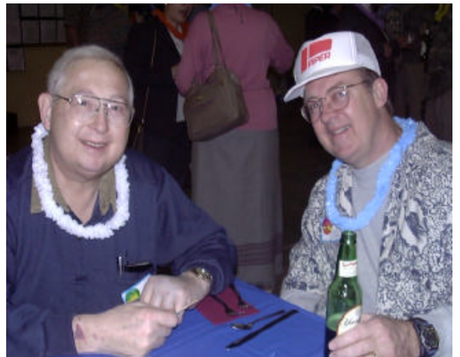
Hey AI, this is our photo opportunity, SMILE