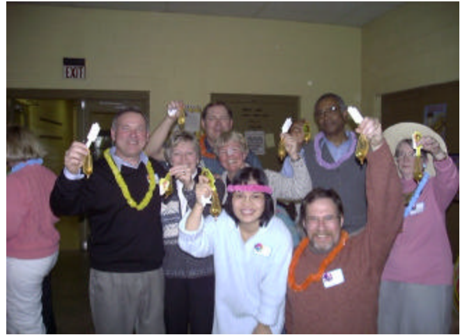
We got the GOLD!