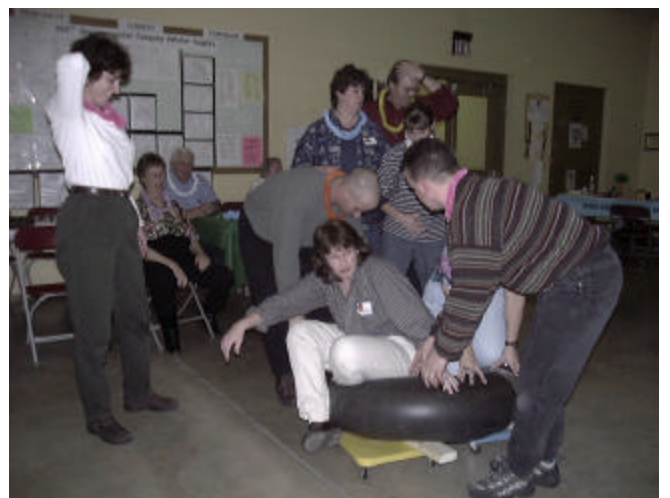
You want us to all get on this one tube!!!! of the contributors, and not necessarily the views of AFSCOR