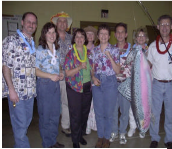
We got the biggest catch of the Social!