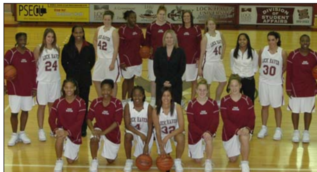
WOMEN'S BASKETBALL 2007-08 CHAMPS Challenge Champion