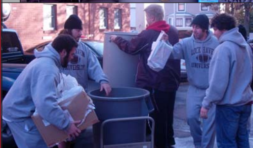
<<<Football's annual food donation to the local Salvation Army