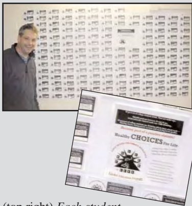
(top right) Each student who attended POWER HOURS signed a card acknowledging the importance of making healthy decisions regarding alcohol consumption.;