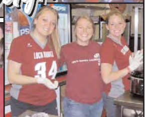
The women's soccer, softball and lacrosse teams hosted a successful Casino Night in February, providing a fun evening for several hundred patrons while raising scholarship dollars for all three programs.