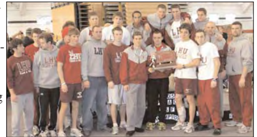
2005 PSAC Indoor Track and Field Championship runners-up