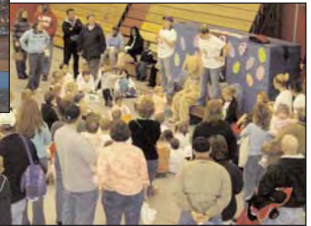
^^ Lacrosse's Easter T-shirt Decorating, Photos with the Easter Bunny, and Easter Egg Hunt

Lock Haven University student-athletes are not only recognized in the intercollegiate athletics community, but have also stepped up to make a difference in the local community. Listed above are some of the projects that LHU student-athletes have undertaken during the 2004-2005 academic year.