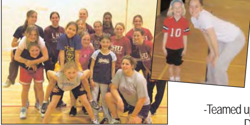
^^ National Girls and Women in Sport Day