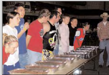
LHU students prepare themselves for the second round of Fear Factor

The members of SAAC planned and ran the event, which included a professional D.J., a wildly popular Fear Factor contest, a Madden tournament, water pong, poker and Twister. Participants received free t-shirts, food and non-alcoholic drinks all night long. A costume contest featured, among others, a swim team dressed in Hawaiian garb, an 80's version of the lacrosse team, the 'Beach Bums' of the football team, and the winners of the costume theme contest from the baseball team, who came in country-western style.