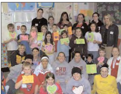
LHU Softball at Mill Hall Elementary on Valentine's Day

Several LHU teams made the rounds at the local schools during Valentine's Day and Dr. Seuss Week. The softball team made Valentine's Day cards and celebrated the day with a group of area youngsters while also returning to the school to read books for Dr. Seuss Day. Track and field, women's basketball, volleyball and all the athletics administrators joined in the trend and went out to the local schools for Read Across America Day.