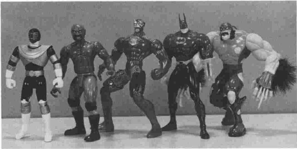
Figure 4. Left to right: The Gold Ranger, 1998 (Mighty Morphin Power Rangers; Bandai America); Ahmed Johnson, 1998 (World Wrestling Federation; JAKKS Pacific); Iron Man with Power Converter, 1998 (Avengers; Toy Biz); Batman, 1998 (Kenner); Wolverine, 1998 (X-men; Toy Biz)

overall has frequently ranked among the top 10 toy lines, Ken is but a small part of this market. Among boys in particular, Ken almost certainly ranks well below the popularity of the other male action figure discussed above ( Playthings magazine).