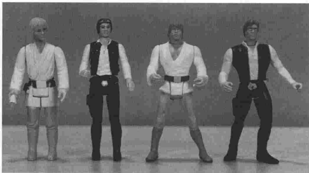
Figure 3: Luke Skywalker and Hans Solo, 1978 (left); Luke Skywalker and Hans Solo, 1998 (right).