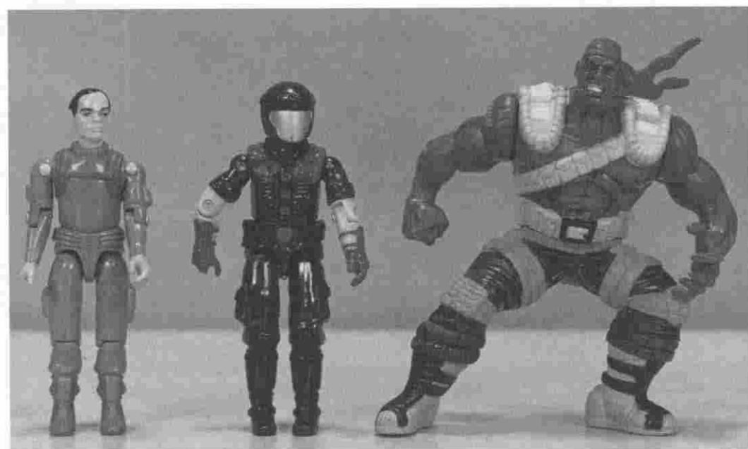
Figure 2. GI Joe Sergeant Savage, 1982 (left); GI Joe Cobra Soldier, 1982 (middle); and GI Joe Extreme Sergeant Savage, 1998 (right).

factured by the Kenner Toy Company). As shown in Figure 3, Luke and Hans have both acquired the physiques of bodybuilders over the last 20 years, with particularly impressive gains in the shoulder and chest areas. Again, the clothing on these small plastic figures precludes accurate body measurements, so that they are not included in Table 1.